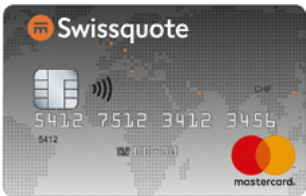
Silver prepaid card