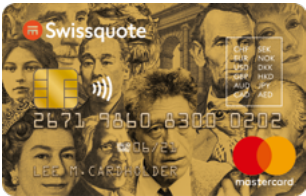
Gold multi-currency credit card

For more information, see the fee schedule and the General Terms & Conditions on our website www.swissquote.com/one-card